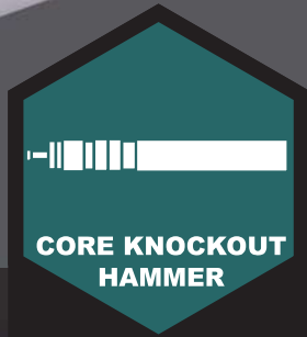
CORE KNOCKOUT HAMMER