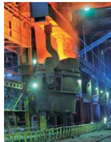
High-Temperature Steel Plants