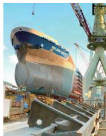
Marina and Shipyards