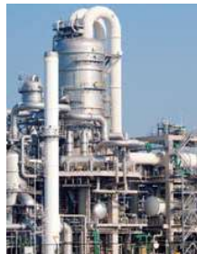
Fire prohibited Chemical Factories

NPK Air Hoists provide efficient workflow in hazardous environments where electrical hoists are prohibited including: fire-prohibited circumstances (petroleum, medicine, and paint manufacturing), underground construction sites, and dusty, hot, and humid conditions.