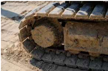
Removing Dirt and Rust

Choose the tool that fits your application.